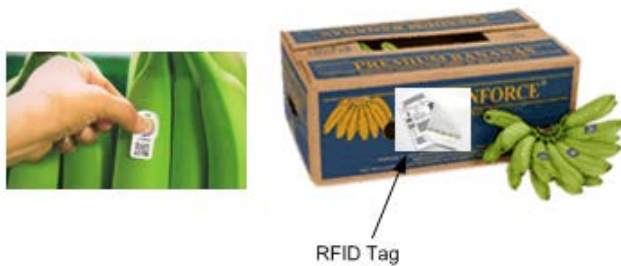
Fig. 3. RFID tagged on a carton box of a product.

In order to identify and track a product, tagging or labeling with identification is required to make a product detected by system. This system used RFID technology as a tool for identification, tracking and traceability thus an RFID tag is needed to stick on product either goods or carton box. In this case a passive RFID tag with inexpensive cost used as a label with some information stored inside the tag, the information represent some important data of the product such as date of expire for food product, farming location (area), manufacturer, supplier and importer. Besides that, with RFID tag product delivery can be track and trace if case happen on the goods for early precaution before reach to the consumer. Figure 3 shows a sample of food product (banana) that tagged on fruit and on carton box, the label on carton box represent number of goods inside then with this system applicable to use in inventory or stockiest for a retailer or supplier.