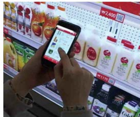
Fig. 5. An example of user scans a selected food product.

Customer as user of food product expected every of product safe to consume, thus information is need to identify whether food product still good (not expire) and supplied from which country or land. Information technology with smart phone or table be able to detect food product with application software installed, mobile equipment very practical to use because of capability to bring any ware. Beside that nowadays most of mobile devices available with RFID scanner or reader which is Near Field Communication (NFC). User by using application software easily scan selected product to check the information and others related detail of product. Figure 5 shows an example of user scanning of a food product at retail store, product information will query to central database that has been uploading by supplier, manufacturer and freight forwarder and also retailer system. With this system user or customer be able to see all products information including delivery time, supplier, expire date, etc.