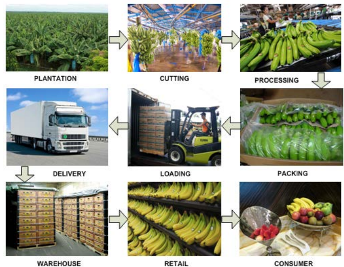
Fig. 1. Food product supply chain management system.

In order to monitor quality and security of a food product, monitoring need to start from first process for example bananas fruit, starting from plantation (location), cutting and processing, packing and delivery then retailing and reach to user for consume. All the plantation location and product batch to be tagged and classified according to the delivery and the data stored in a big central data based to be shared to other parties.